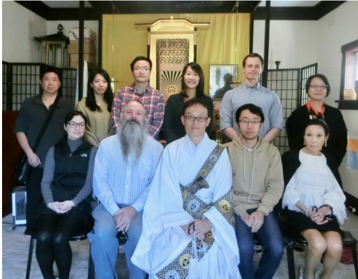
Group photo was taken after the Gotan-e service. (20/05/18)