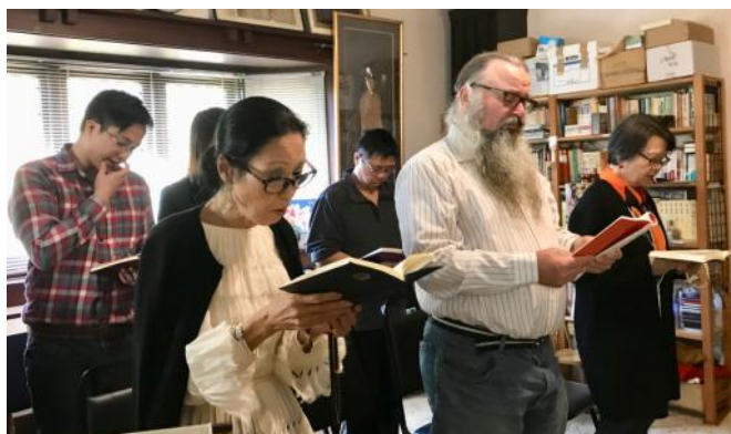
Everyone enjoyed singing the Gotan-e Gatha! (20/05/18)