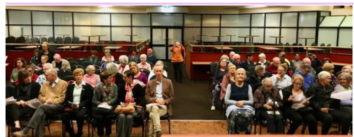
Many people showed their interest about meditation and also to Buddhist teachings. (02/05/18)