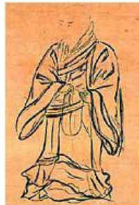
Shinran Shonin 1173-1263