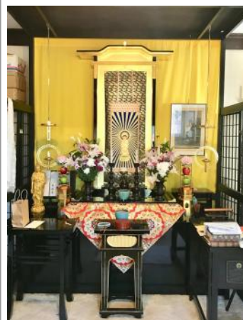
HBMA shrine was beautifully decorated for Gotan-e. (20/05/18)

During the ceremony, we chanted Shoshin-ga with Junirai tune, and sang "Shuso Gotan-e (Founder's birthday)" together. Then, I delivered both English and Japanese Dharma messages based on my memories during my University activities for Gotan-e festival.