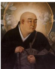
Honen Shonin 1133-1212

Another thing I would like to mention is "Sangha". When I was in Canada, majority of Buddhist followers in North America understood Sangha to mean the general Buddhist community, while it originally meant just Buddhist monks, who abandoned family life to engage in many religious practices as their daily routine - not living for money, just begging for their daily meals.