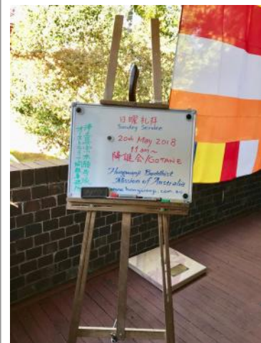
Entrance way of HBMA (20/05/18)

After a group photo, the AGM was convened. I was again elected as Chairperson. All activities of HBMA during the year, and financial reports were presented. New budget for the current calendar year was approved. Everyone also agreed that the need and hopes for the continued existence of HBMA is still very high, and that HBMA should continue functioning here in Sydney. Therefore whatever help you can give to our mission will be greatly appreciated. Please also share your thoughts about our mission with us.