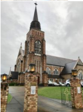
Lismore's St Andrew's Anglican Church where Anzac Eve ceremony took place. (24/04/18).