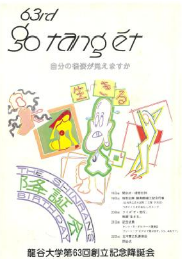
1984 Gotan-e Poster

This time I drew a very simple image. A cartoon-like monk (Shinran Shonin) sitting with his hands in Gassho, surrounded by stylised female figures (right).