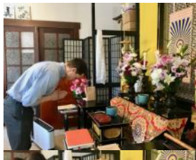
Ms Verroll offering incense (20/5/18)